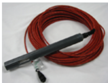
Digital Hydrocarbon Probe (DHP-485) Visit product page ▶