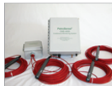
CMS-4000 Continuous Monitoring System Visit product page ▶