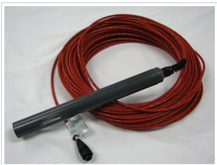
Figure 2: PetroSense Digital Hydrocarbon Probe

These probes are used with various instruments such as the PetroSense CMS-4000 that has a data logger that can be connected to 4 probes. These probes can be left in-situ (in real time) for continuous monitoring of the environment for hydrocarbons. The data logger has a modem so that the data can be retrieved by telephone from the office. The probes are also used with a field portable instrument the PetroSense Portable Hydrocarbon Analyzer PHA-100. These instruments show very good correlation to GC analysis of hydrocarbons (Graph 1).