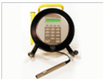
Portable Hydrocarbon Analyzer Visit product page ▶

PetroSense.com info@petrosense.com Tel: + 1 (214) 483.1003