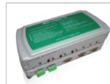
CMS-1500 Envirologger Visit product page ▶