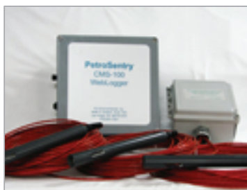
CMS-100 Web Logger Visit product page ▶