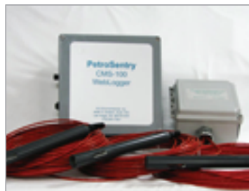
CMS-100 Web Logger Visit product page ▶