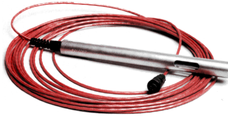
Figure 2 A PetroSense® hydrocarbon probe

These probes are used with various instruments such as the PetroSense CMS 4000 that has a data logger that can be connected to 4 probes. These probes can be left in situ for continuous monitoring of the environment for hydrocarbons. The probes are also used with a field portable instrument the PetroSense® PHA 100. These instruments show very good correlation to GC analysis of hydrocarbons (Graph 1).